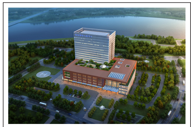
Figure 2. Western Zhejiang Heart Institute.

Optimization of percutaneous coronary intervention (PCI) results through physiology and imaging guidance is an important area of interest. In a prospective, multicenter, randomized controlled trial of POST-dilatation to improve outcomes in ST-segment–Elevation Myocardial Infarction patients undergoing